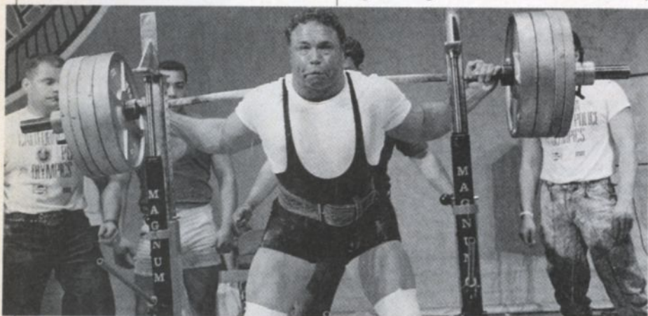
Contestants in POWERLIFTING: DAY 2

These Police Olympics tapes are typical examples of cinema verite , though they have no shape or form, even as documentaries. Much more like stream of consciousness writing, one image or catalyst bounces off another, until each tape stops — as if the camera ran out of tape, rather than that the event concluded. Although the camera work is raw and unprofessional, these tapes will appeal to a select group, of which you may just find yourself a member. [L.B.]