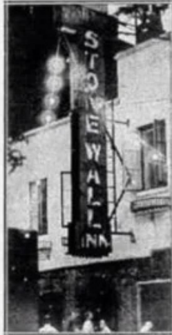
The Stonewall Inn

Last Friday the privacy of the Stonewall was invaded by police from the First Division. It was a raid. They had a warrant. After two years, police said they