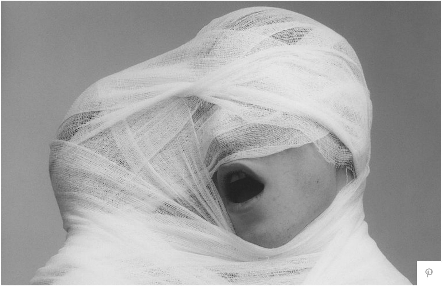
Robert Mapplethorpe, White Gauze, 1984