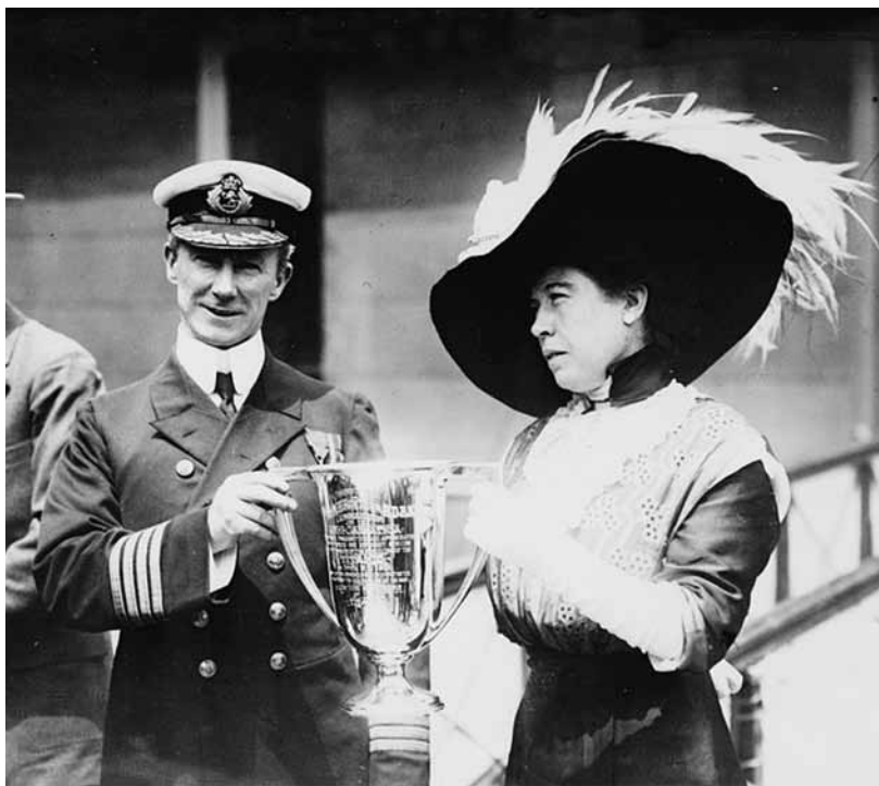
One month after the sinking of Titanic , Molly Brown attended a memorial ceremony in New York.