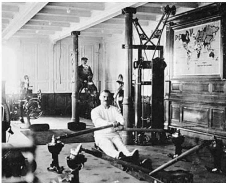
The Titanic Gymnasium One of the Titanic engines