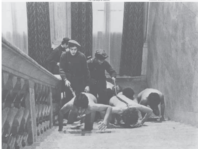
PIER PAOLO PASOLINI'S