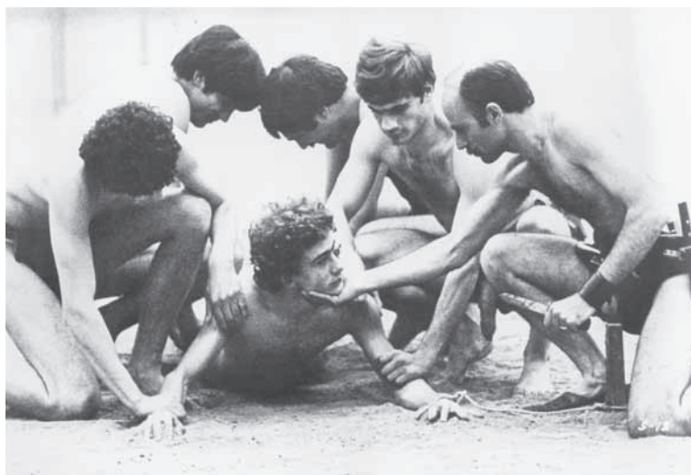
PIER PAOLO PASOLINI'S