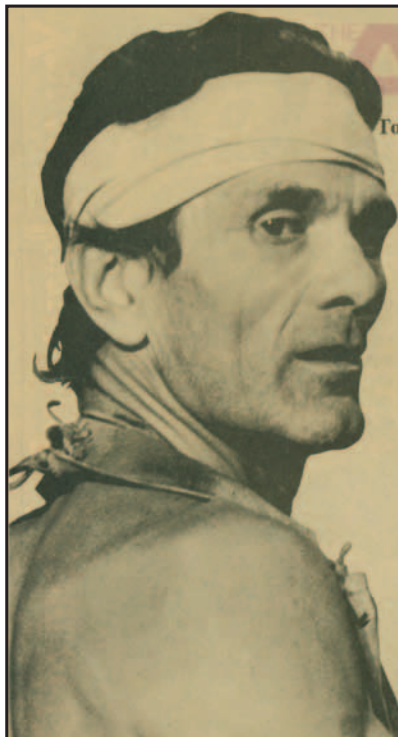
"Pier Paolo Pasolini," 1974, publicity photograph.